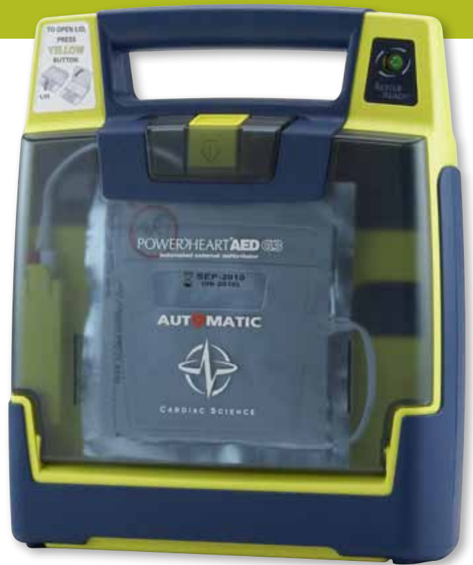
The Powerheart AED G3 Plus Automatic

Cardiac Science Corporation • 3303 Monte Villa Parkway, Bothell, WA 98021 USA • 425.402.2000 • US toll-free 800.426.0337 • Fax: 425.402.2001 • info@cardiacscience.com